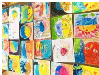
Above: Bela; Toshan's clay figure; Year 1& 2 artwork samples