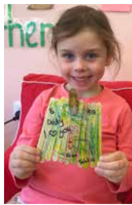
Left: Samples of the childrens' artworks