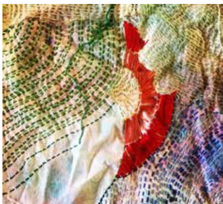
Top: Nitai sketching Above: Year 7-8 visual art stitching task